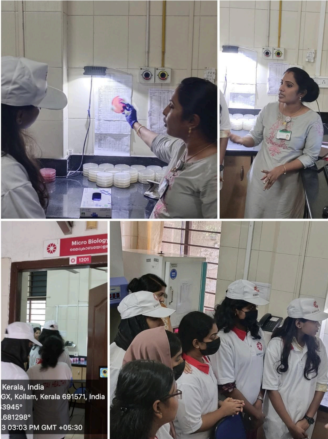
Microbial Mysteries Unveiled: A Glimpse of Students Exploring the Microbiology Lab